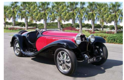
(Above Photos submitted by Ralph Curtis – Being chased by this brute would be no laughing matter!! Ed.)